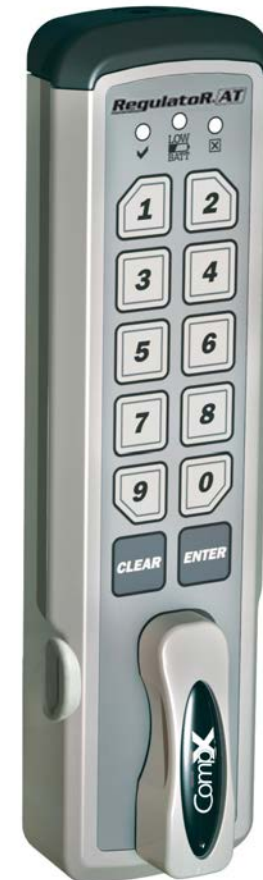
Electronic lock with audit trail, NSLL2 option.