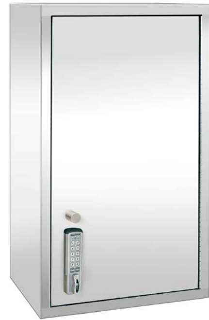
Optional electronic locks.