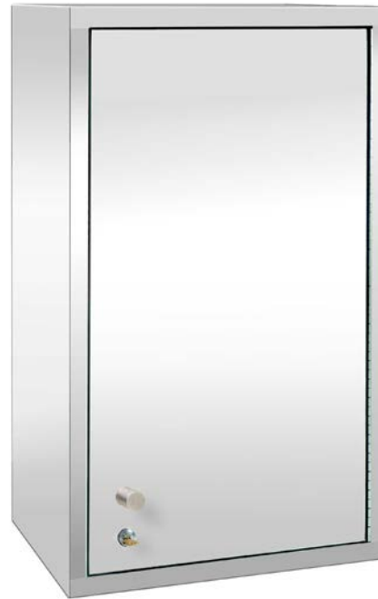
Standard with 2 keyed locks.

See pages 2 and 3 for option details and model numbers.