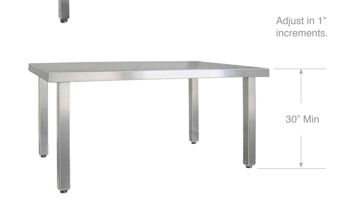
Table height can be easily adjusted in 1" increments with telescoping legs. Legs are then locked in place with set screws for wobble free stability. Height range is 10" from 30" sitting height to 40" tall standing height. Custom height combinations available.